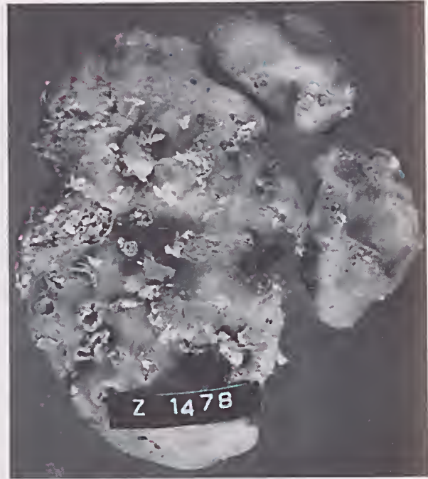
Fig. 2— Biminia macrotoxa sp. nov. Holotype NTMZ1478 (NMVF51373). 120×80 mm.

fistules. Remains of approximately 10 small fistules are present on upper surface, but few are entirely intact;